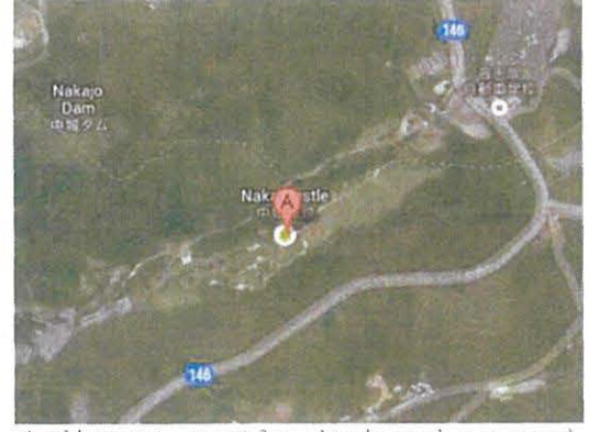
(adjacent castle depicted on map)