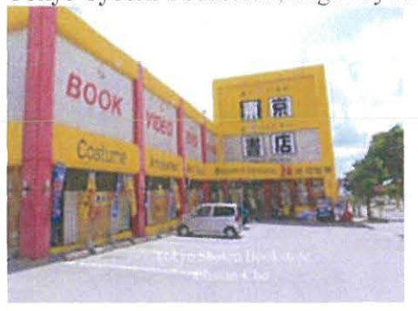
Tokyo Syoten Bookstore, Highway 23 at 820-6 Kamisedo, Chatan-Cho, Okinawa, Japan